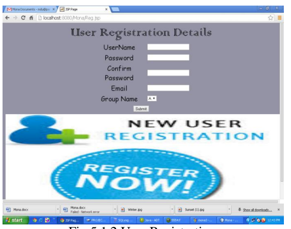
Fig 5.1.2 User Registration

Here the user has to register their details for their registration process. Give their user name, password, email-id and select group name which group belongs to.