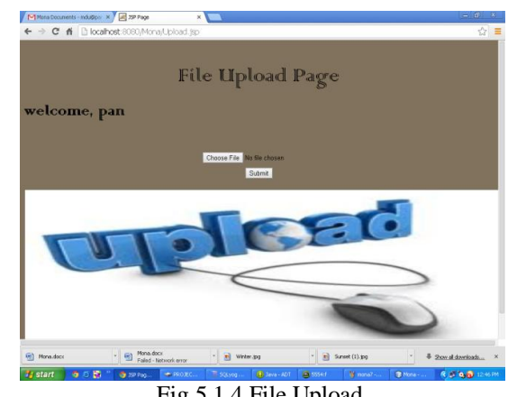
Fig 5.1.4 File Upload

Here the user want to upload the file, choose the file which are going to be upload, from the particular place and then click the submit option. Then the file will be upload successfully.