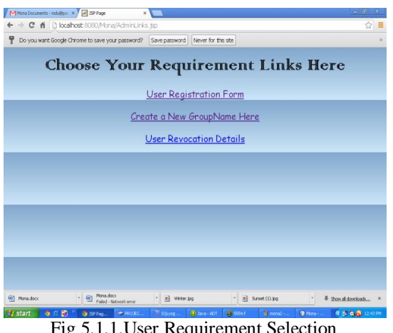
Fig 5.1.1.User Requirement Selection

The first process is to any one from the list. If new user came then the user has to do registration process. If they want to new group then select Create a New Group Name Here option. To view the Revocation details from the User Revocation Details option