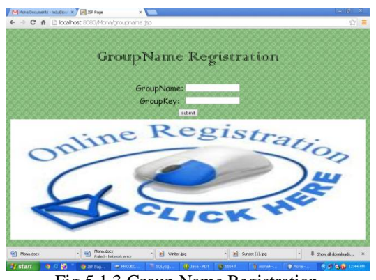
Fig 5.1.3 Group Name Registration

Here the group manager create the Group Name and Group Key for the newely created group.